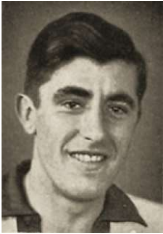
Ernst LEHNER (1912-1986)