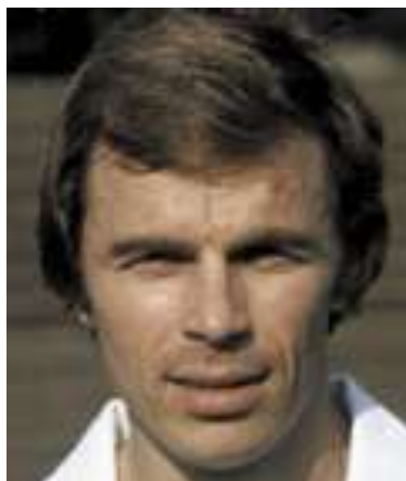
Bernard (Enatz) DIETZ (b. 1948) 53 A, Germany Left Back/Sweeper Cup finalist 1975 Euro winner 1980 Euro finalist 1976

Bernard 'Enatz' Dietz started out as a left winger in 1970 playing for MSV Duisburg. In the summer of 1972 he was withdrawn to the left back position where he established himself as a very good attacking full back. A player with a pretty good technique, he was notable for his high work ethic and was unrelenting yet fair in one-on-one situations. In 17 years as a professional he was booked only 11 times and never sent-off. He is the defensive player with the highest amount of goals scored in Bundesliga history (76 goals). With his never say die mentality, dynamism, willingness to run and fight at all costs and self-sacrificial mentality he became one of the best left backs of the 1970s. He also managed to keep a high level of consistency between 1970 and 1985 when he almost never missed a game in all those years (played in 494 of 510 possible games).