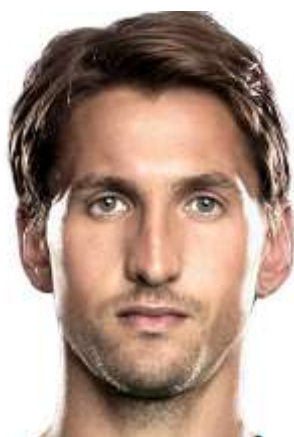
René ADLER (b. 1985) 12 A, Germany, Goalkeeper League runner-up 2011 Cup finalist 2009 Euro finalist 2008

At the end of the 2000s René Adler was on his way to becoming the no. 1 goalkeeper in German football, he was the designated goalkeeper of the national team at the 2010 World Cup but an injury prevented him to take part in this tournament. Adler is one of the most complete goalkeepers, but he needs to be at his best to really be outstanding. Almost perfect is his timing when leaving his goal and very good is his initiating of offensive actions and of course his ball control. At the start of his career, the charismatic Adler was considered the most reliable and consistent goalkeeper of the league and generally rated higher than Manuel Neuer. Not always assured in dealing with high crosses, Adler never played for a really great side with great defenders in front of him which is a disadvantage in the long run compared to his competitors Manuel Neuer and Roman Weidenfeller. Prone to injuries.