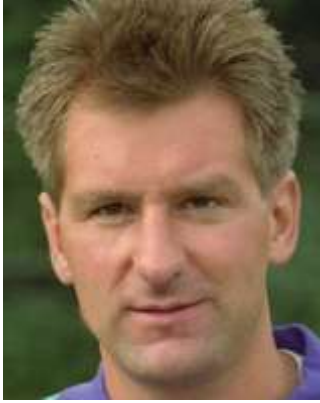
Eike IMMEL (b. 1960) 19 A, Germany, Goalkeeper League champion 1992 UEFA Cup finalist 1989 Euro winner 1980 World Cup finalist 1982, 1986

When he debuted in 1978 at the age of 17 Eike Immel became the youngest ever goalkeeper of the Bundesliga. He was Dortmund's number one goalkeeper from season 1979-80 on until he joined Stuttgart in 1986. During his time in Dortmund, he only missed a single game between 1979 and 1986. A very quick moving keeper, like many other goalkeepers of his era, he possessed excellent reflexes but was not as good when he had to leave his goal. He was the number three goalkeeper of the German national team with Harald Schumacher and Uli Stein ahead of him, but in 1986 luckily for him Harald Schumacher was suspended from international duties due to his scandalous book "Anpfiff" and Uli Stein had been sacked by Franz Beckenbauer during the 1986 World Cup due to defiant and insubordinate behaviour. Thus Immel was suddenly the no. 1 goalkeeper. He guarded Germany's goal during the 1988 European Championship but unexpectedly resigned shortly after the tournament because Bodo Illgner, the young Köln goalkeeper, was selected by Franz Beckenbauer to start in goal in the first World Cup qualifier against Finland in September 1988. Immel later stated that this was the biggest mistake of his career.