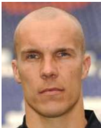
Robert ENKE (1977-2009) 8 A, Germany, Goalkeeper League champion 2004 Euro finalist 2008

It didn't look like Enke had what it takes to become a great goalkeeper before he joined Hannover: he was rated as a great talent in Mönchengladbach, did not do too well playing for Benfica, was sitting in the stands during his stay in Barcelona and left Fenerbahce after one week. In Hannover he finally proved that he was one of the most complete goalkeepers of the 2000s, equally strong on the goalline and at leaving the goal, immensely assured in killing crosses and technically advanced so that he was able to use his feet sufficiently well. Enke shockingly committed suicide in 2009 as a consequence of his long-going depressions.