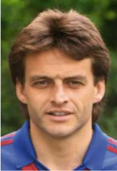
Matthias HERGET (b. 1955) 39 A (4 goals), Germany, Defensive Midfielder/Libero Cup winner 1985 World Cup finalist 1986

A classic libero who in possession immediately acted as a forward-moving midfielder, Herget was gifted with a superb technique and a love for adventure on the pitch. From 1983 to 1988 Herget was regarded as one of the very best Bundesliga players. Not at all a tackler, the lightfooted Herget was a libero in the vein of Beckenbauer who wanted to solve every defensive situation in a playful way. Very good at short and long passes and a good reader of the game. A downside was his habit to sometimes lose concentration which could lead to severe blunders, hence his reputation as a happy-go-lucky chap. Herget is still the only player in German professional football who managed to score a hattrick with three penalties.