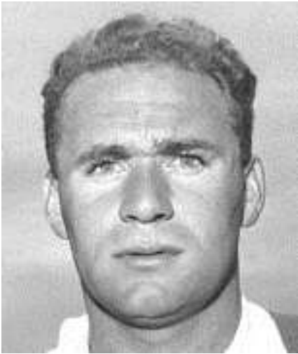
Herbert (Ertl) ERHARDT (1930-2010) 50 A (1 goal), Germany, Full Back/Centre-Half World Cup winner 1954

Made his debut in 1948 aged 18 as a right half for Fürth. An athletic defender with a good touch on the ball and impressive aerial presence, he first played as a full back before switching to centre half by the late-1950s. In both positions he was counted among the very best in 1950s German football. Known for his hard tackling and doggedness, Erhardt captained Germany between 1959 and 1962 and was a member of the 1954 (did not play), 1958 and 1962 World Cup squads.