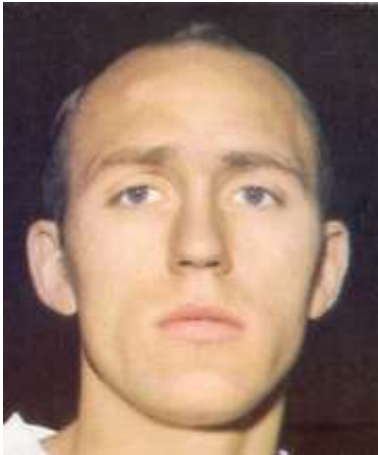
Willibald (Willi) SCHULZ (b. 1938) 66 A, Germany, Half Back/Sweeper Cup finalist 1967 CWC finalist 1968 World Cup finalist 1966

Willi Schulz was a hard as iron right half and later sweeper who was known as the 'the master of the sliding tackle'. He captained the national team 20 times and was arguably the most important defensive player during the second half of the 1960s. His international breakthrough was the 1966 World Cup after which he was considered as one of the very best central defenders in Europe. During the next four years, Schulz remained the undisputed standard sweeper of Germany. In November 1968, he was part of the FIFA XI that faced Brazil in Rio de Janeiro. Schulz would have been the standard sweeper of Germany during the 1970 World Cup, but an injury of the meniscus as well as a calf bruise meant that he only started in two of the six World Cup games in Mexico. In his place, Karl-Heinz Schnellinger played as sweeper.