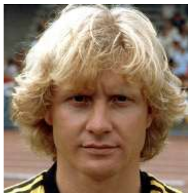
Manfred BURGSMÜLLER (b. 1949) 3 A, Germany, Central Midfielder/Forward/Striker League Champion 1988 League runner-up 1986 Cup finalist 1989, 1990

For his time, the streetwise Burgsmüller was a rare type of player in the Bundesliga, a hybrid between a striker and a midfielder who was difficult to classify. Always a great goalscorer, he was often found playing in a deep midfield position, often right in front of his defense where he did like to pick up the ball. Burgsmüller cherished the time on the ball hence he preferred to drop deep into midfield as he wouldn't get too much time on the ball as a striker. On the ball, Burgsmüller demonstrated a high standard of ball control which allowed him to pass by defenders quite easily. In front of the goal he was a lethal finisher, great at volleying the ball and despite his small stature he was also a capable header of the ball. His specialty was sneaking into the box almost unnoticed, blessed with a real poacher's instinct. Additionally to his finishing ability he also was a good provider for other players. What might have hindered his career in the national team was his reputation of being a "troublemaker". Regardless, it is a bit of scandal that a player of this quality only made three international appearances.