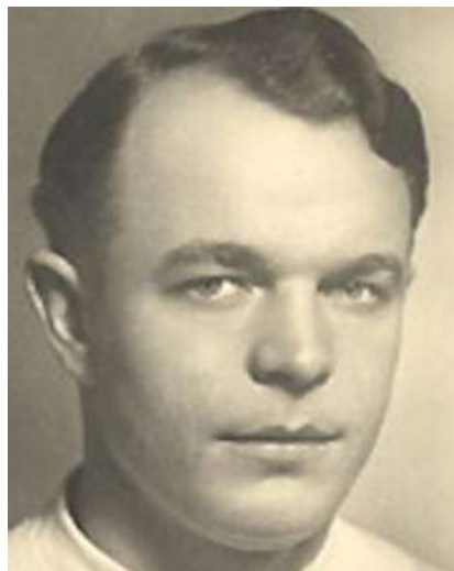
Johannes (Hanne) SOBEEK (1900-1989) 10 A (2 goals), Germany, Inside Right League champion 1930, 1931 League runner-up 1926, 1927, 1928, 1929 Top Scorer Championship 1929

Berlin's greatest football idol Hanne Sobek was an exuberant and lively forward with high football intelligence. Upon joining Hertha BSC in 1925, Sobek became highly instrumental in establishing Berlin as one of Germany's strongest football outposts. Under his guidance, Hertha reached the German championship final six times in succession (winning twice), an unheard of record at the time and later only equalled by the great FC Schalke 04 side of the 1930s/40s. Football monthly "Fussball" wrote on Sobek: "a fine, elegant technical player who set up his teammates in an exemplary manner, carving out picture book chances for his teammates so that these only had to kick the ball over the goalline." Hanne Sobek is still the idol of Berlin football. This is not only due to his class as a player but also because of his sincere and upright character. His international career however left a little bit to be desired. He didn't really manage to get past the role of a fringe player for Germany.