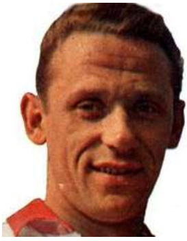
Alfred (Alfredo) PFAFF (b. 1955) 7 A (2 goals), Germany, Inside Forward League Champion 1959 Champions Cup finalist 1960 World Cup winner 1954

To this day Alfred Pfaff's name is inseparable with one of the greatest chapters in the history of the Eintracht Frankfurt club. An inside left who had spent three years as a prisoner of war he was the most instrumental figure in the rise of Eintracht Frankfurt to become one of the foremost powers in German football during the 1950s. Pfaff was the offensive linchpin of Eintracht Frankfurt, renowned for his superb technique, a virtuoso on the ball, which may explain his nickname "Don Alfredo". Pfaff was unlucky that in his position an even better player was available, one Fritz Walter, who was always preferred to Pfaff by Germany manager Sepp Herberger. Pfaff was adept at delivering precise through balls and very good at taking freekicks.