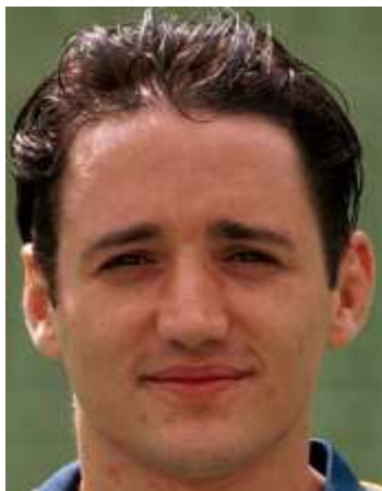
Oliver NEUVILLE (b. 1973)