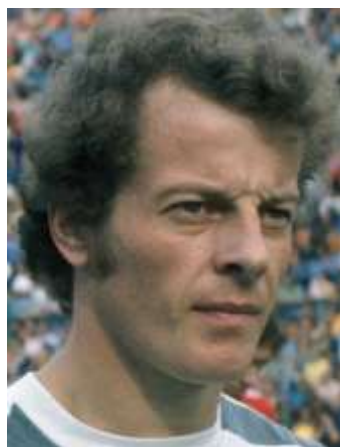
Herbert (Hacki) WIMMER (b. 1944) 36 A (4 goals), Germany, Right Wing/Right Midfielder League champion 1970, 1971, 1975, 1976, 1977 League runner-up 1974, 1978 Cup winner 1973 UEFA Cup 1975 UEFA Cup finalist 1973 World Cup winner 1974 Euro winner 1972 Euro finalist 1976