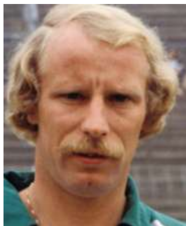
Hans-Hubert (Berti) VOGTS (b. 1946)