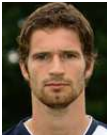
Arne FRIEDRICH (b. 1979) 82 A (1 goal), Germany, Right Back/Centre-Back Euro finalist 2008

Reliable, strong in defensive one-on-one situations, fast and a great header of the ball. Good positioning and reliable in defense. Flawed was his lack of offensive strengths, not a good crosser and also not a very refined passer. Arne Friedrich was much more suited for a central defensive role but since there was a lack of good right backs in his club and in Germany (Philipp Lahm was still playing as left back in the 2000s), he had to content with having to play in the demanding full back role.