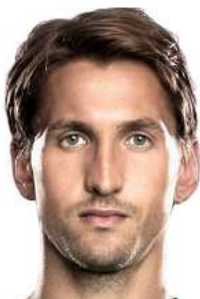
René ADLER (b. 1985) 12 A, Germany, Goalkeeper League runner-up 2011 Cup finalist 2009 Euro finalist 2008

At the end of the 2000s René Adler was on his way to becoming the no. 1 goalkeeper in German football, he was the designated goalkeeper of the national team at the 2010 World Cup but an injury prevented him to take part in this tournament. Adler is one of the most complete goalkeepers, but he needs to be at his best to really be outstanding. Almost perfect is his timing when leaving his goal and very good is his initiating of offensive actions and of course his ball control. At the start of his career, the charismatic Adler was considered the most reliable and consistent goalkeeper of the league and generally rated higher than Manuel Neuer. Not always assured in dealing with high crosses, Adler never played for a really great side with great defenders in front of him which is a disadvantage in the long run compared to his competitors Manuel Neuer and Roman Weidenfeller. Prone to injuries.