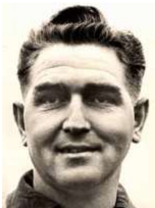
Anton (Toni) TUREK (1919-1984) 20 A, Germany, Goalkeeper World Cup winner 1954

Toni Turek is, together with Sepp Maier, Heiner Stuhlfauth and Radi Radenkovic, one of the most legendary and revered goalkeepers in German football history. His reflexes were outstanding and he was a supreme catcher of the ball in all possible situations. This was coupled with a steadfast calmness and made him the outstanding goalkeeper in Germany around 1950. Turek was already part of the national team roster in 1942.