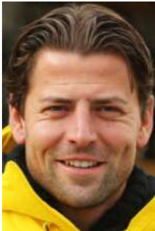
Roman WEIDENFELLER (b. 1980)