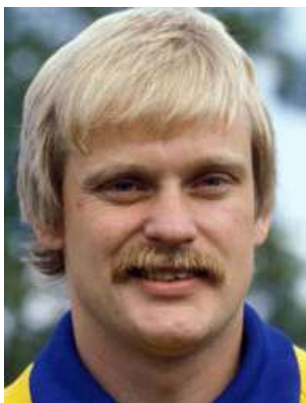
Ronnie HELLSTRÖM (b. 1949) 77 A, Sweden, Goalkeeper Cup finalist 1976, 1981 Swedish Footballer 1971, 1978

A legendary goalkeeper who played ten seasons for Kaiserslautern and is rated among the all-time greatest Swedish players. Excellent on the goalline but like many keepers of the 1970s not faultless when he had to leave his goal. A very tall player, Hellström privately enjoyed listening to the music of Tchaikovsky.