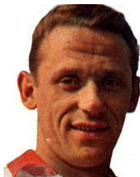
Alfred (Alfredo) PFAFF (b. 1955) 7 A (2 goals), Germany, Inside Forward League Champion 1959 Champions Cup finalist 1960 World Cup winner 1954

To this day Alfred Pfaff's name is inseparable with one of the greatest chapters in the history of the Eintracht Frankfurt club. An inside left who had spent three years as a prisoner of war he was the most instrumental figure in the rise of Eintracht Frankfurt to become one of the foremost powers in German football during the 1950s. Pfaff was the offensive linchpin of Eintracht Frankfurt, renowned for his superb technique, a virtuoso on the ball, which may explain his nickname "Don Alfredo". Pfaff was unlucky that in his position an even better player was available, one Fritz Walter, who was always preferred to Pfaff by Germany manager Sepp Herberger. Pfaff was adept at delivering precise through balls and very good at taking freekicks.