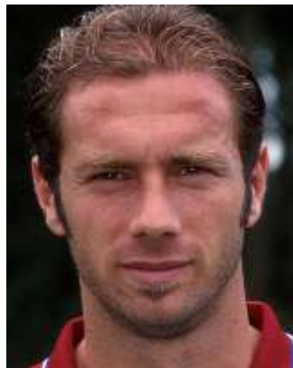
Sergej BARBAREZ (b. 1971) 45 A (17 goals), Bosnia, Midfielder/Forward Bosnian Footballer 2001, 2003 Top Scorer League 2001

A typical 'wanderer' between striker position and offensive midfield position. His greatest asset was his finishing skill. An intelligent and creative forward with a certain versatility, as Barbarez was also useful on the left wing.