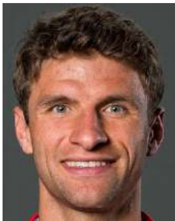
Thomas MÜLLER (b. 1989)

89 A (37 goals), Germany, Forward/Right Wing League champion 2010, 2013, 2014, 2015, 2016, 2017 League runner-up 2009, 2012 Cup winner 2010, 2013, 2014, 2016 Cup finalist 2012 Champions Cup 2013 Champions Cup finalist 2010, 2012 Intercontinental Cup 2013 World Cup winner 2014 Top Scorer World Cup 2010