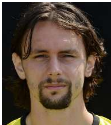
Neven SUBOTIĆ (b. 1988) 36 A (2 goals), Serbia, Centre-Back League champion 2011, 2012 League runner-up 2013, 2014, 2016 Cup winner 2012 Cup finalist 2014, 2015, 2016 Champions Cup finalist 2013

A fine athlete and at his best a rock in defense and also offensively dangerous. The Serb was the perfect complement to Mats Hummels in the Dortmund defense during that club's great phase in the early 2010s. More physical and somewhat unconventional in his approach than Hummels, Subotic is a defensive enforcer. Like Hummels, he preferred to play long precise passes from the back.