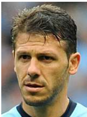
Martín DEMICHELIS (b. 1980) 50 A (2 goals), Argentina, Centre-Back/Defensive Midfielder League champion 2002, 2003, 2005, 2006, 2008, 2010, 2014 League runner-up 2004, 2009, 2015 Cup winner 2005, 2006, 2008, 2010 World Cup finalist 2014 Copa America finalist 2015 Champions Cup finalist 2010