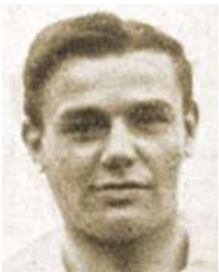
Maximilian (Max) BREUNIG (1888-1961) 9 A (1 goal), Germany, Centre-Half (pyramid) League champion 1910 League runner-up 1912

The centre-half of FV Karlsruhe was one of the most popular players in the German Reich during his days and still must be regarded as one of Germany's all-time greatest players. Breunig was very tall (1.94 metres, 6.36 inches), had a large frame and a powerful built. Additionally to football, he also engaged in shot-putting, javelin throw and multi sport race (in the 1912 Olympics Breunig competed in athletics pentalon). Because of his imposing appearance, the people in charge of FV Karlsruhe initially wanted him to be the goalkeeper, but Breunig was intent on being an outfield player. Thus soon he debuted aged 16 on the left wing. The legendary English coach William Townley soon recognized that Breunig's refined technical skills and his great understanding of the game demanded a more central role on the pitch.