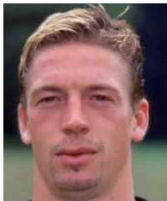
Steffen FREUND (b. 1970) 21 A, Germany, Defensive Midfielder League champion 1995, 1996 Champions Cup 1997 Intercontinental Cup 1997 Euro winner 1996

A typical 1990s defensive midfielder, hard as iron, determined, emotional. The extrovert Steffen Freund would chase the ball and the opponent for 90 minutes. While his skill on the ball was average, he would spark his teammates and lived mainly off his industriousness and combative spirit.